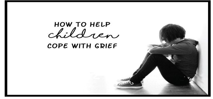
Holding you in prayer, The Home Life Team

Death can be a complicated subject. It's a topic that can make people feel uncomfortable. It's easy to tell ourselves that kids won't understand what's happening when a loved one is dead or dying. The truth is even very young children know there is something wrong in their world. Pretending it is not happening will only make a child feel more unsure or upset. Here's some helpful tips to talk with kids about grief, death & dying.