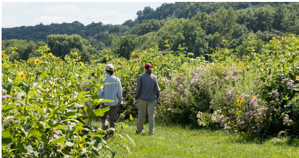
Pollinator gardens, such as this Gateway Prairie at Luther College in Decorah, provide food and habitat for bees and butterflies. The Northeastern Iowa Synod’s Care for Creation Network offers ideas and resources to help congregations implement their own care for creation projects and conservation practices.