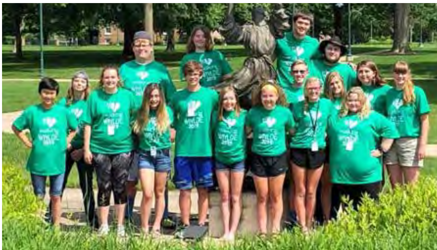
WIYLDE CLASS OF 2019

Registration is due by Friday, May 1, 2019. Download the registration form at www.neiasynod.org/wiylde .