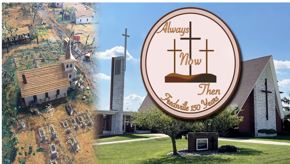
Fredsville Lutheran, Cedar Falls, celebrates 150 years with the theme “Always, Now, Then.”