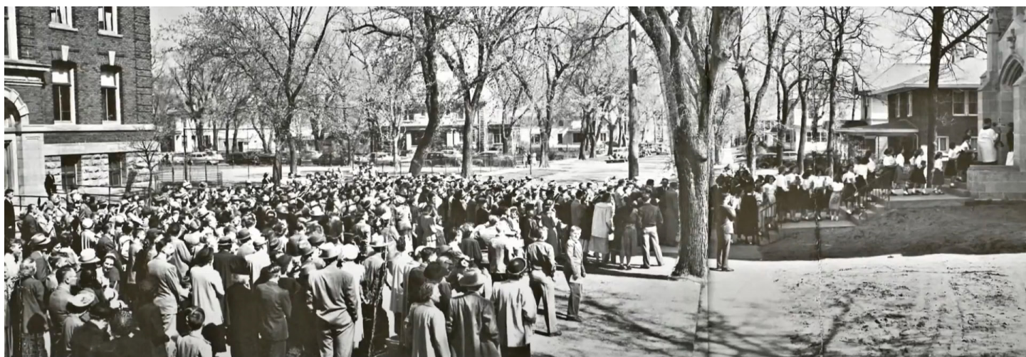
A procession of worshippers from Trinity Lutheran, Mason City, walk from the Palace Theater, where worship services took place for a number of years, to the new and current sanctuary building during a dedication service in May 1950.