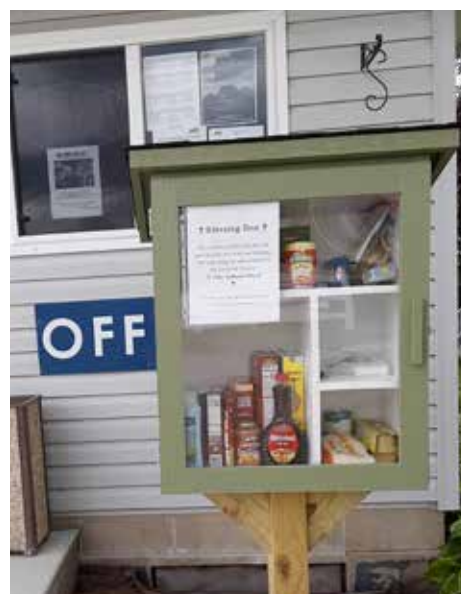
Little Free Pantry “blessing box” at the Denver mobile home park.