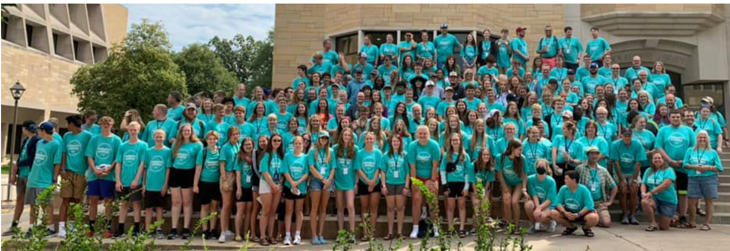
More than 220 youth and adults from 20 congregations and four synods participated in the Boundless Gathering at St. Paul, Minn. The Northeastern Iowa Synod sponsored the event