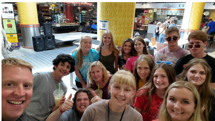
The group from Trinity, Mason City, enjoys lunch at the Midtown Global Market.