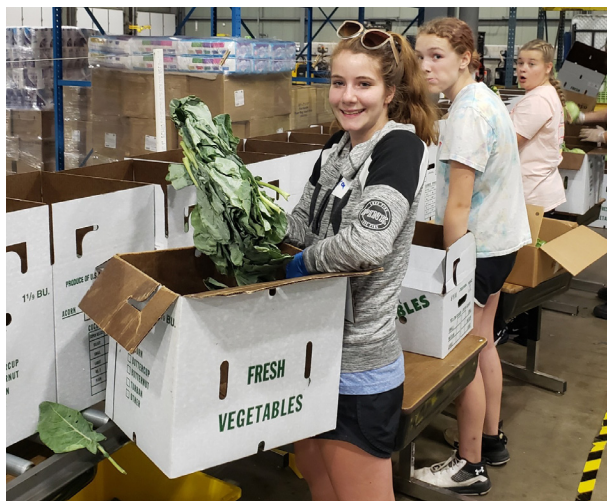
Youth from Grace, Tripoli, volunteer at The Food Group.

Youth gather to learn about God's boundless love << Continued from page 2