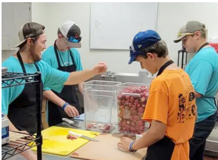
Youth from St. Paul, Monona, process radishes for the Loaves & Fishes organization.