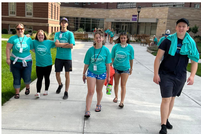
Youth from Zion, Oelwein, head to closing worship service.