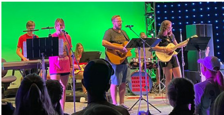
Members from First Lutheran and Good Shepherd, Decorah, share their music ministry as the house band for worship services at the Boundless Gathering at St. Paul, Minn.