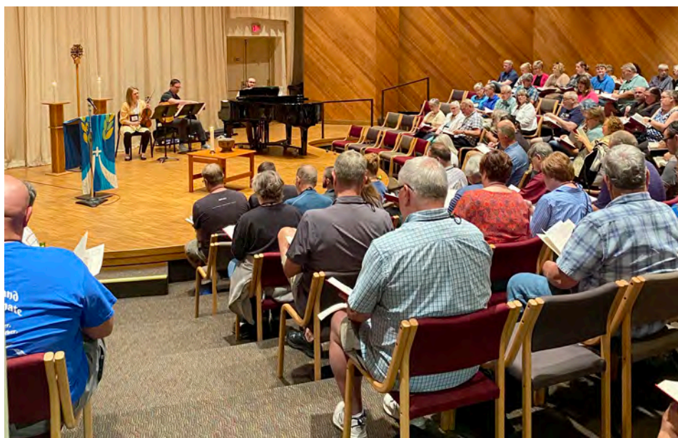
Friday night worship service at the 2023 Northeastern Iowa Synod Assembly.