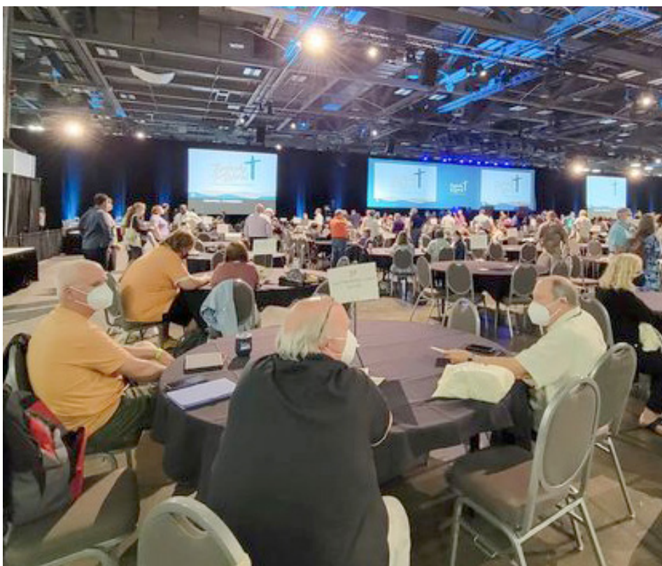
The view from the Northeastern Iowa Synod voting members’ seats at the Churchwide Assembly.